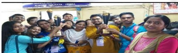
12, Biplabi Kanai Bhattacharya Sarani, Alipore Police Line, Alipore, Kolkata, West Bengal 700027, India 22 Sep 2022 03:13 pm