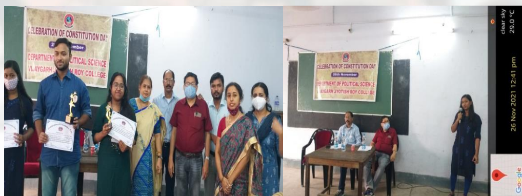
Fig 9: Celebration of the Constitutional Day on 26 th November , 2021.