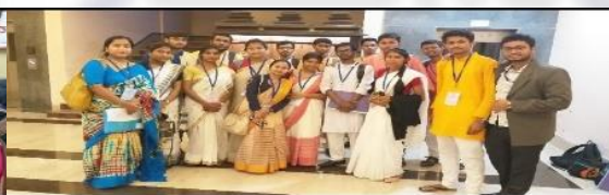
CCP2+3F8, Narendrapur, Kolkata, West Bengal 700103, India 21 Sep 2022 05:38 pm