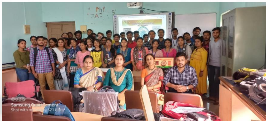
Celebration of the Constitutional Day on 26 th November , 2022.