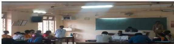
Ramakrishna Mission Ashram, CCQ2+C35, Main Rd, Narendrapur, Kolkata, West Bengal 700103, India 21 Sep 2022 01:52 pm