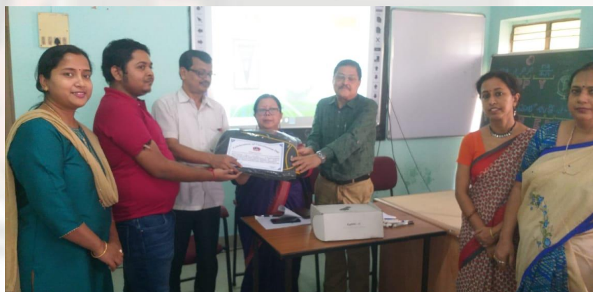
Celebration of the Constitutional Day on 26 th November , 2022.