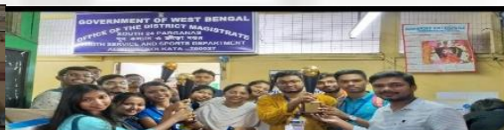
G8GP+QWV, Alipore Police Line, Alipore, Kolkata, West Bengal 700027, India 22 Sep 2022 03:13 pm